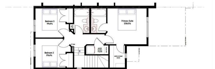
UNIT SQFT - UPPER 630sq ft