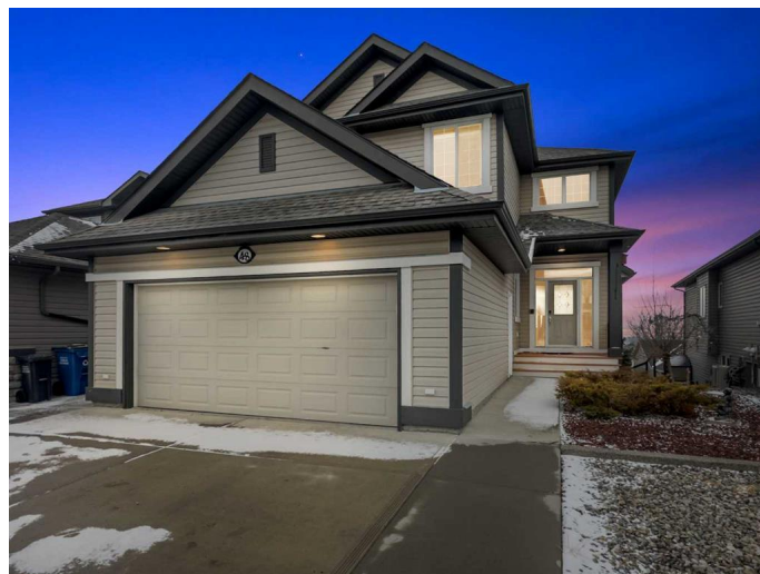
48 Sunset Cl, Cochrane, AB

Step inside to find a sun-filled interior, with large windows framing the breathtaking mountain vistas. Hardwood floors lead you from the welcoming foyer into the expansive living space, where the kitchen, dining, and living room flow seamlessly together. The gourmet kitchen features beautiful cabinetry, a large wrap around eat-up island that easily sits 8, granite countertops, stainless steel appliances, ample pantry space—perfect for both cooking and entertaining. Off the large kitchen dining, an patio space ideal for hosting barbecues, reading a book or simply enjoying the stunning mountain views, sunsets and nature at large. The cozy living room includes a gas fireplace, setting the tone for a warm