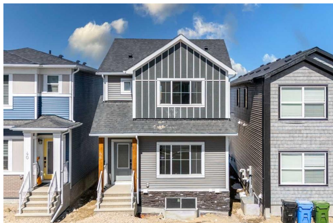
44 Lewiston Dr NE, Calgary, AB

Designed for modern living, this stunning residence seamlessly blends elegance, functionality, and comfort. Upon entering, you™ll be greeted by an abundance of natural light and an open-concept layout that effortlessly connects the inviting family room, illuminated living room, and stylish kitchen. Luxury vinyl plank flooring flows throughout the main level, offering both durability and timeless appeal. This home surpasses standard builder specifications with premium upgrades, including sleek cabinetry, elegant interior doors, designer light fixtures, and sophisticated quartz countertops in the kitchen and bathrooms. Every detail has been carefully curated for refined living. Upstairs, discover three generously sized bedrooms, each offering comfort and charm. The primary suite is a true retreat, featuring a spacious layout, a double vanity, and a separate shower. The unfinished basement presents a versatile space with a separate exterior entrance and a bathroom rough-in- ideal for future development as a legal suite. Your vision can easily come to life. Step outside to the backyard with a large deck, perfect for entertaining or relaxing. Located near the parks, pathways, and recreational facilities, with access to schools, child care, and future