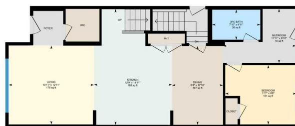
0 4 8 ft PREPARED: 2025/04/15 White regions are excluded from total floor area in GUIDE floor plans. All room dimensions and floor areas must be considered approximate and are subject to independent verification.

Main Floor Exterior Area 938.20 sq ft Interior Area 859.85 sq ft