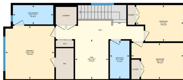
0 4 8 ft PREPARED: 2025/04/15 White regions are excluded from total floor area in GUIDE floor plans. All room dimensions and floor areas must be considered approximate and are subject to independent verification.

1st Floor Exterior Area 395.58 sq ft Interior Area 830.08 sq ft